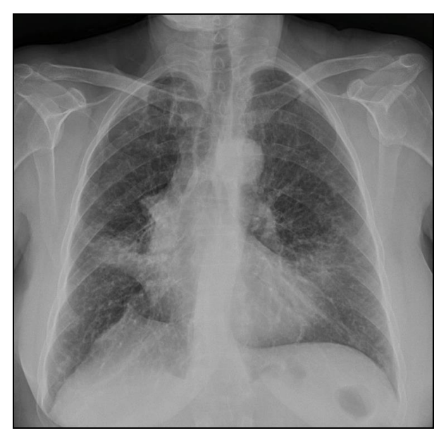
Figure 1. Chest X-ray of the patient before BAL.