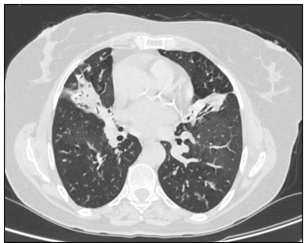
Figure 3. Tomography image before BAL (parenchymal section).

Erythrocyte sedimentation and white blood cell elevation were detected in the routine laboratory examinations (biochemistry and complete urine) of the patient whose results were negative for acid-fast bacillus (AFB) in sputum. It was decided to perform BAL on the patient. Emergency chest x-ray was taken to the patient who had sudden shortness of breath, chest pain and tachycardia after BAL. Right pneumothorax was detected in the chest X-ray of the patient (Figure 4).