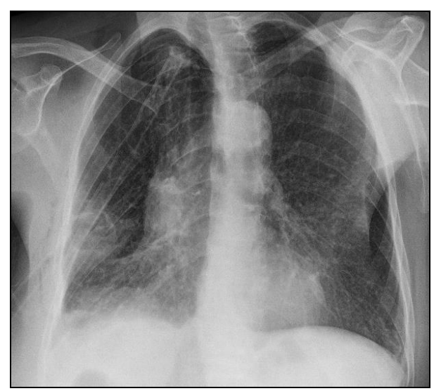
Figure 5. Chest X-ray of the patient after tube thoracostomy.

Right tube thoracostomy was performed to the patient. In the control radiographs, the tube of the patient whose lung was expanded and who did not develop complications was terminated (Figure 5).