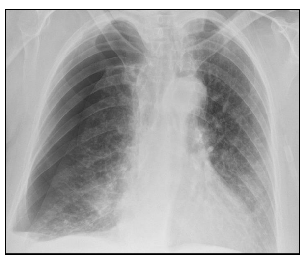
Figure 4. Chest X-ray of the patient after BAL.

Erythrocyte sedimentation and white blood cell elevation were detected in the routine laboratory examinations (biochemistry and complete urine) of the patient whose results were negative for acid-fast bacillus (AFB) in sputum. It was decided to perform BAL on the patient. Emergency chest x-ray was taken to the patient who had sudden shortness of breath, chest pain and tachycardia after BAL. Right pneumothorax was detected in the chest X-ray of the patient (Figure 4).