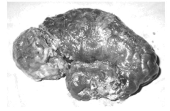
Figure 2. The making resection left hemisphere

* Motor function was scored according to the motor item scale of the NIH stroke scale for arm or leg (0 = no drift; 1 = limb drift; 2 = some effort against gravity; 3 = no effect against gravity; 4 = no movement)<sup>3,4</sup>