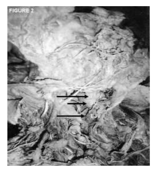
Figure 2. Right side of the face is shown. Retromandibular vein (RMV) is undivided; facial vein (FV) is draining into the external jugular vein (EJV).