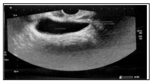
Figure 1: Transrectal ultrasonography (TRUS) shows no left seminal vesicle and right hypoplastic seminal vesicle with ovoid cystic shape (2.0x0.8cm).