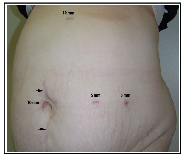
Figure 3. Trocar sides of the patient are shown. Arrows indicate the midline incision scar due to the previous abdominal operations.