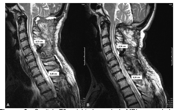
Figure 2. Sagital T2-weighted cervical MRIs revealed a syringomyelia descending from C1 to T3 level with CM-I at 14 mm tonsillary herniation, 0.6 mm in diameter (A) and a significant decrease in the diameter of the syringomyelia at postoperative third month, 0.34 mm in C5 and 0.24 mm in T2 level, respectively (B).