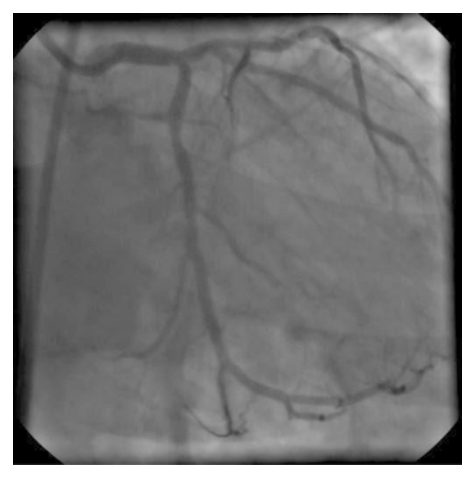
Figure 2. Shows angiographic result after 3x14 mm BMS implantation.