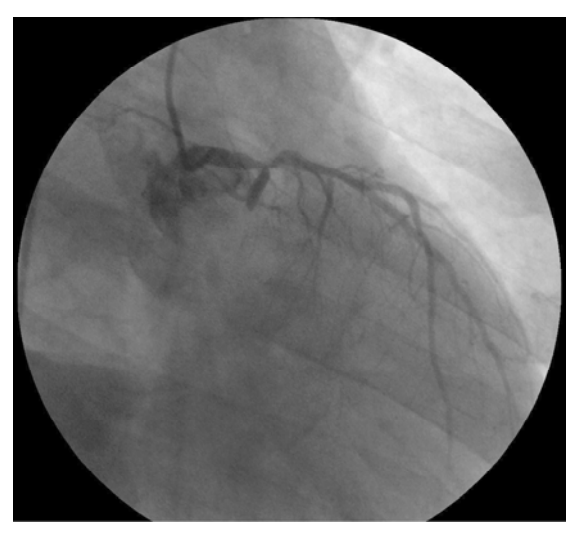
Figure 3. Shows acute stent thrombosis after 45 months.