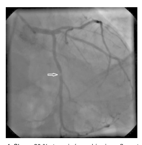
Figure 1. Shows 80 % stenosis (arrow) in circumflex artery.

2x12-mm balloon (Figure 4). Although the patient was a candidate for surgery due to ostial left anterior descending coronary artery lesion, a 3x28-mm bare metal stent was implanted with restoration of TIMI-3 flow (Figure 5) because of unsuccessful previous balloon angioplasty and ongoing chest pain. At the day 3, the peaks of CK and CK-MB enzymes were observed. Transthoracic echocardiography showed little impairment of left ventricular systolic function with global EF 45 %. Routine blood biochemistry and hemograms tests were performed after 12-hour overnight fast. Glucose, cholesterol and hematocrit levels were within normal limits while vitamin B12 level was 153.9 pg/ml (191 pg/ml - 663 pg/ml). Because of low vitamin B12 level, another blood sample was taken in the following morning after 12hour overnight fast and homocysteine, protein C, protein S, and lipoprotein (a) levels were measured. Only homocysteine level was abnormally high at 29.3 micromol/L which was two-fold of the upper limit for that age. The patient was supplemented with folic acid for hyperhomocycteinemia. Patient was sent to surgery after a month of aspirin and clopidogrel treatment.