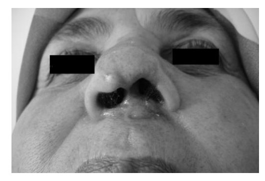
Figure 3. Postoperative view of patient after one year.