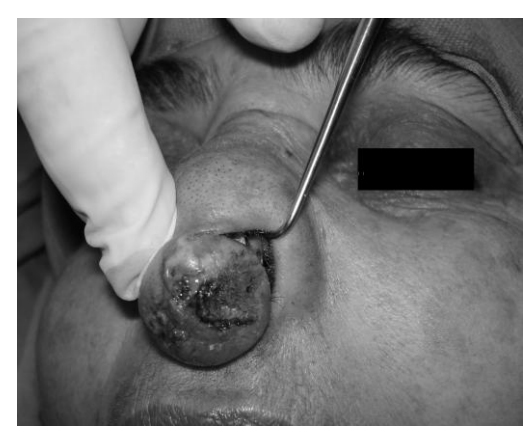
Figure 1. Preoperative view of mass

neck ultrasound. Incisional biopsy revealed "squamous cell carcinoma". There was no bone invasion on maxillofacial computerized tomography (CT). Distant metastasis was not detected at thorax CT and whole body bone scaning. Under general anesthesia, solid mass excision was performed by leaving surgical margin 0.5 cm from border of enduration. The reconstruction was carried out with a nasolabial flap. Histopathologic review of the specimen revealed as "well-differentiated squamous cell carcinoma, surgical margins are clean" (Figure 2). Patient has no evidence of recurrence and second primary tumor in endoscopic examination since 1-year follow-up (Figure 3).