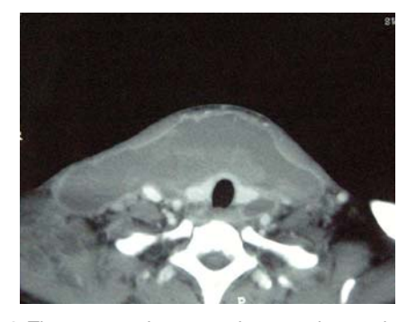
Figure 4. The computed tomography reveals massive cervical hematoma and right internal jugular vein thrombophlebitis