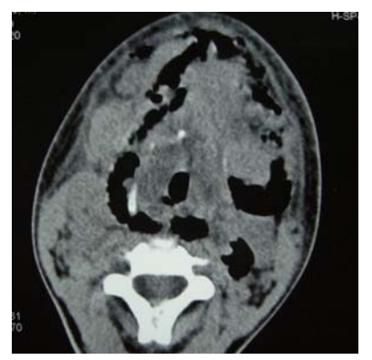
Figure 2. The computed tomography reveals a deep neck abscess and emphysema