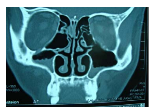
Figure 1b. Control CT taken 2 years after the surgery reveals no mucocele.