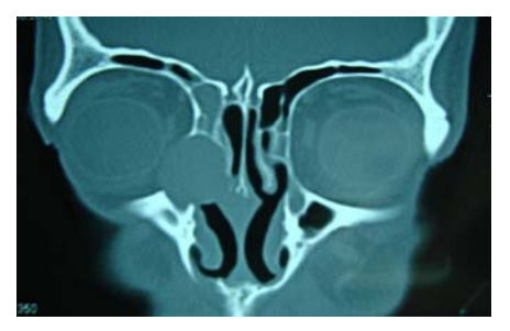
Figure 1a. The cystic mass near left maxillary sinus ostium, filling the ethmoid sinuses causing erosion in lamina papirecea.

linic with left sided facial and periorbital pain. He had no history of trauma, surgery or allergy. The physical examination was normal. The computed tomography (CT) in coronal view revealed a cystic mass near the left maxillary sinus ostium, filling the ethmoid sinuses causing erosion in lamina papirecea (Figure 1a). The patient underwent endoscopic sinus surgery under general anestesia. The mucoid material was drained and the cyst marsupialized. The diagnosis of a mucocele was comfirmed histologically. The patient uneventfully recovered from surgery and continues to do well 2 years after the surgery (Figure 1b).