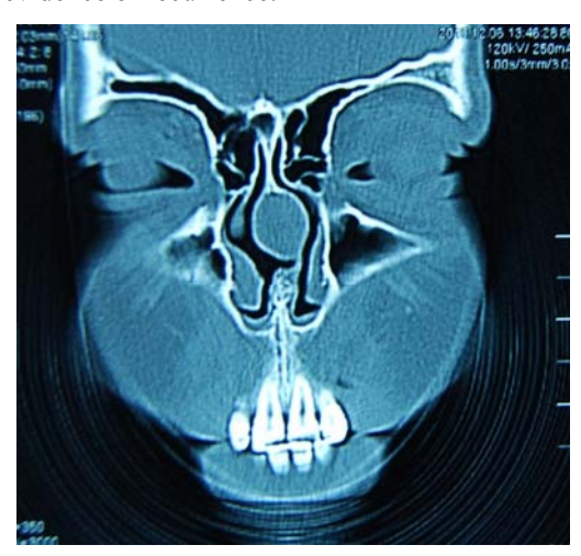
Figure 5. The midline mass localised in the nasal septum.

A 13 years old boy was admitted to our clinic with a one-year history of bilateral nasal obstruction, especially on the left side. He had no smell disorder and denied any visual symptoms. He had no history of major maxillofacial trauma or nasal surgery. On his nasoendoscopic examination, bilateral septal swelling that was more prominent on the left side and minimal adenoid hypertrophy was detected. A CT revealed a large midline septal mass without intracranial extension (Figure 5). The patient underwent endoscopic drainage and total excision of the septal mucocele and endoscopic mini-septoplasty under general anaesthesia. There were no remnants of cartilage or bony septum identified within the septal mucocele. The diagnosis of a mucocele was confirmed histologically. He was symptom free over the next 10 months and there were no evidence of recurrence.