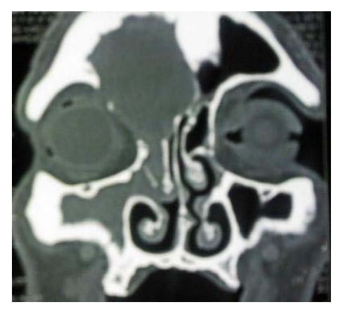
Figure 4. Left frontal opacity in the left frontal sinus that was thought to be a mucocele was seen.

A 41 years old female was admitted to our outpatient clinic with a resistant headache localised on the left supraorbital region. She had no history of trauma or surgery. A nasoendoscopic examination found a mucopurulent secretion in the left nasal cavity. The paranasal sinus CT proved a left frontal opacity that was thought to be a mucocele (Figure 4). The patient underwent frontal sinus surgery with osteoplastic flap and frontal obliteration with fat. The procedure was accomplished successfully without complications. Nearly one year since the procedure, the patient is without recurrence or complication.