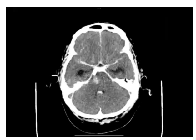
Figure 2. Repeat non-contrast computerized tomography brain showed Subarachnoid hemorrhage (black arrow).

The patient did not report any incidents of head trauma or falling, nor had a bleeding diathesis or intracerebral bleed in his medical history. Additionally, following consultation with a neurosurgeon, nimodipine was initiated, while Mannitol, Dexamethasone, and other "anti-edema" treatments were not administered.